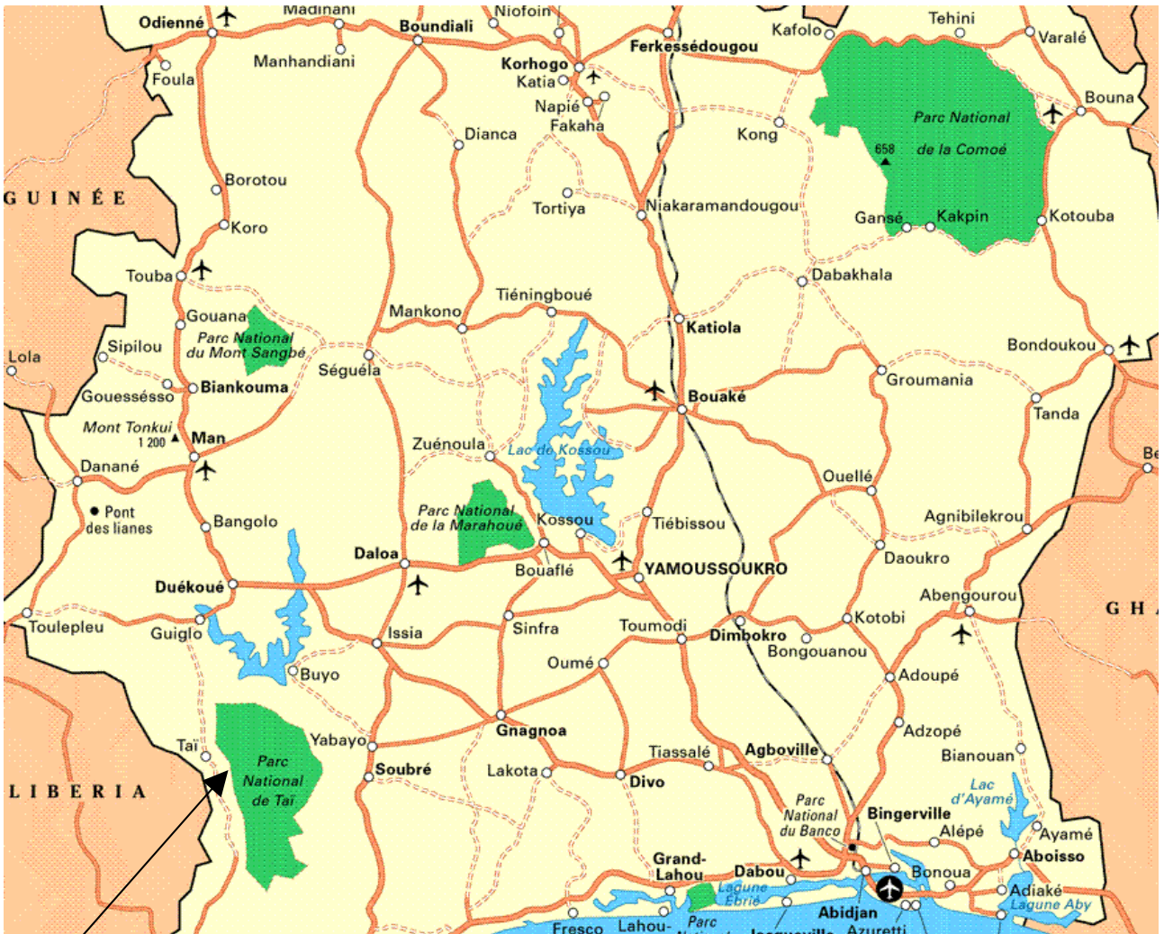
Figure 1: Location of Taï Monkey Project in Taï National Park. (University of Texas Libraries, 2009)