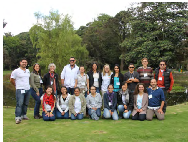
Promoting Conservation in Colombia Through Training & Collaboration Workshop, Colombia