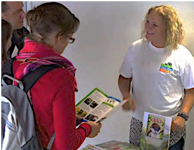
European Federation for Primatology Congress, Europe