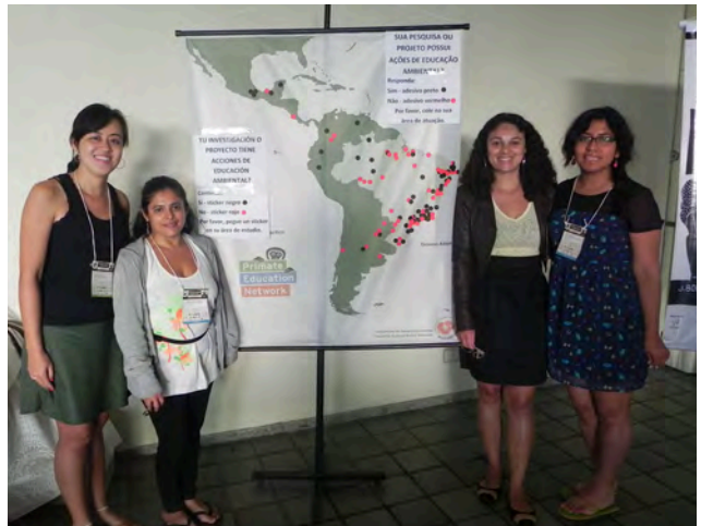
XI Brazilian Primatology Congress, Brazil