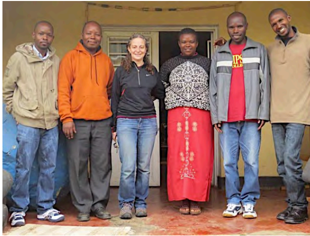
Meeting with the Conservation Heritage - Turambe, Rwanda