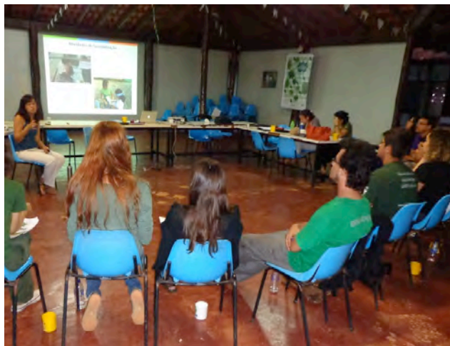
IV Brazilian Field Primatology Course, Brazil