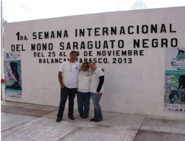
International Black Howler Monkey Festival, Mexico