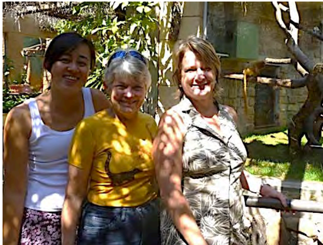
PEN-Brazil Regional Meeting, Brazil