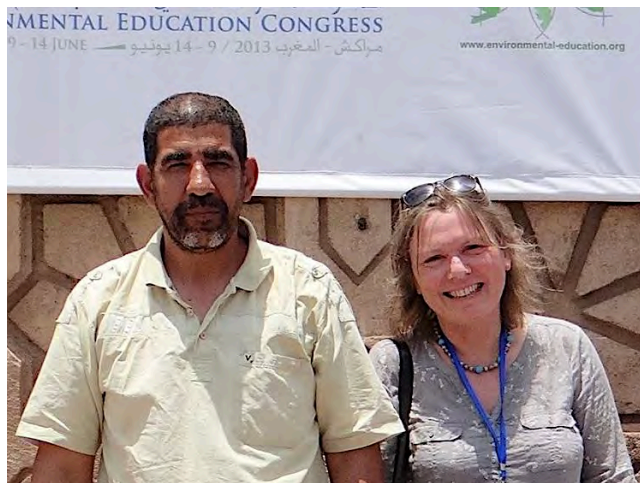
7th World Environmental Education Conference, Morocco