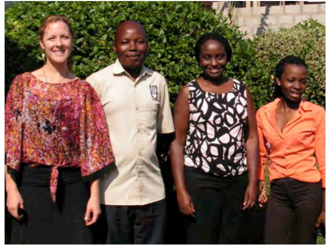
PEN-East Africa Regional Meeting, Uganda