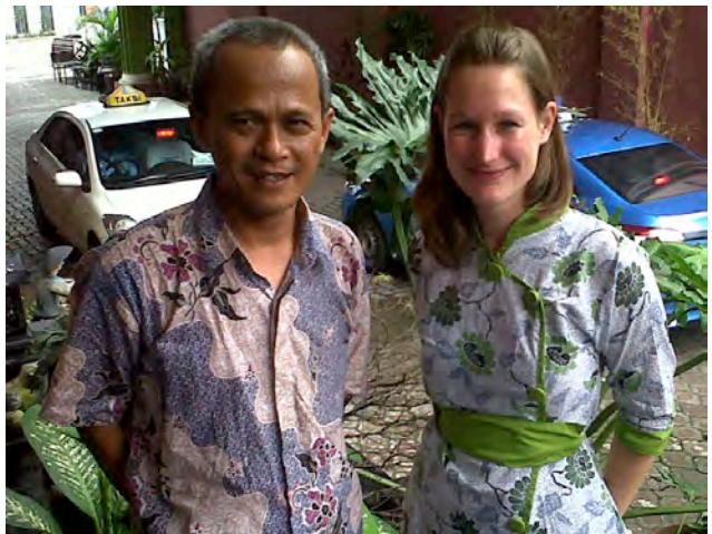
PEN-Indonesia Regional Meeting, Java