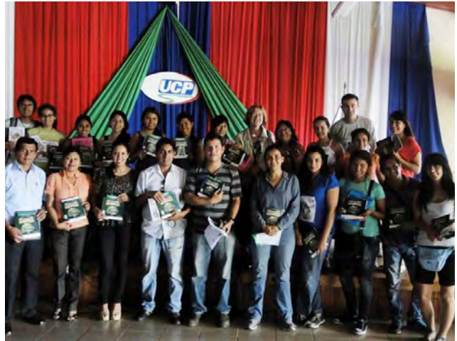
II Primatology Symposium, Peru