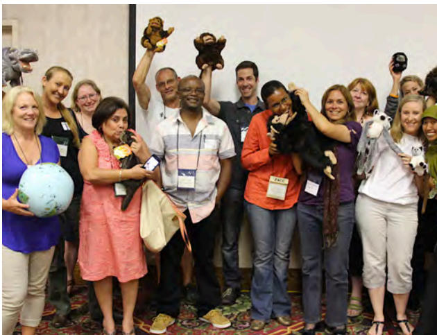
Zoos & Aquariums Committing to Conservation Conference, U.S.A.